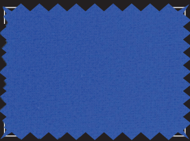
● 5316 new blu cina