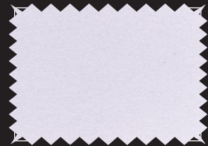
0210 white / 0120 PFP