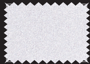
1410 white / 1910 PFP