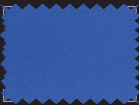
● 5316 new blu cina