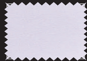
5710 white / 1210 PFP