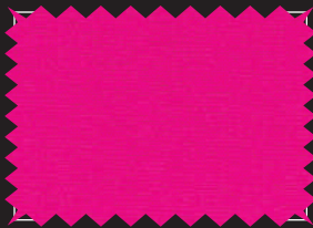
*2413 neon pink