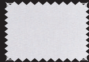
07110 white / PFP