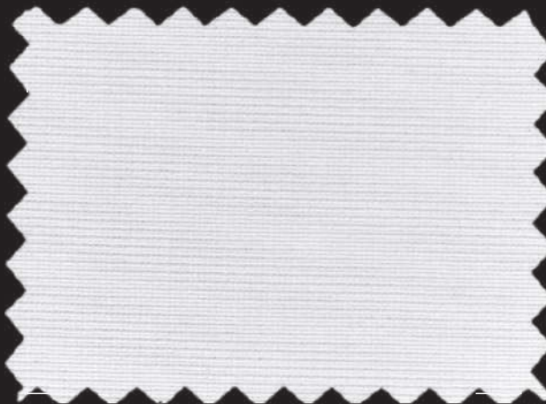
0710 white - 2210 white PFP