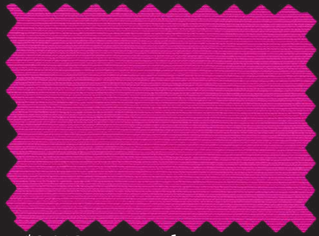
*2413 neon pink