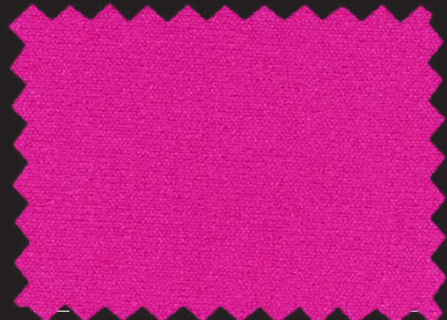
*2413 neon pink