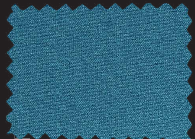
10717 deep teal