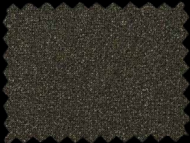
9917 dark olive