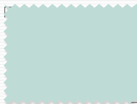
12717 CORYDALIS BLUE