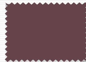
4718 COCOA POWDER