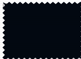
2616 WASHED NAVY