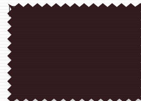
4718 COCOA POWDER